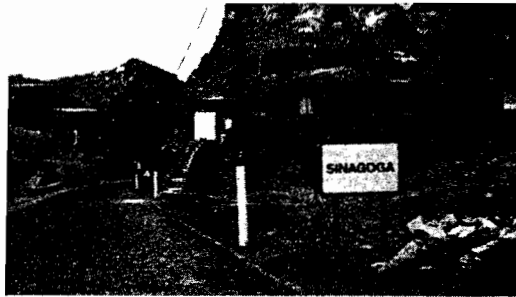
FAMILIAR NAME — The village of Sinagoga in Cape Verde.